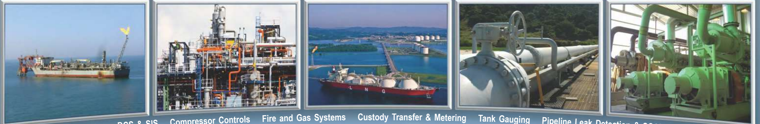
Valves and Instrumentation DCS & SIS Compressor Controls Fire and Gas Systems Custody Transfer & Metering Tank Gauging Pipeline Leak Detection & SCADA Asset Optimization